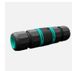
Tube Evo IP68 Connector 5 poles, Ø7 to Ø12mm