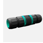
Tube Evo IP68 Connector 5 poles, Ø7 to Ø12mm