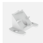
Fitting accessories 45°