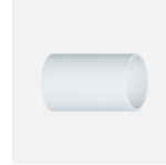
Snoot 72mm for Onit